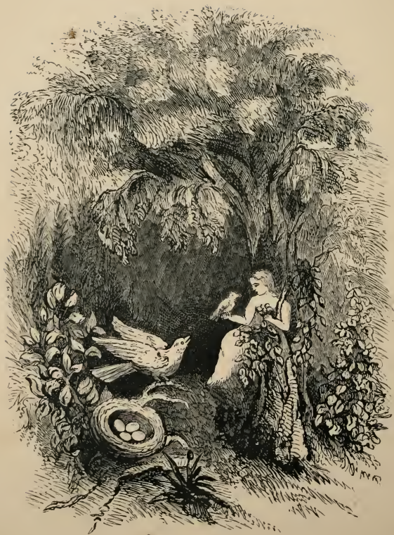
Forest home of Little Bud.